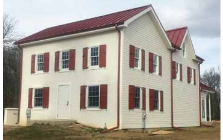
Top: Completed Jester Farmhouse envelope, March 3, 2022.

We have signed a 20+ year lease with New Castle County for the farmhouse and 1.3 adjacent acres of the parcel. We will incur no rent or taxes, in exchange for our operations. Our demographic target includes all members of the community.